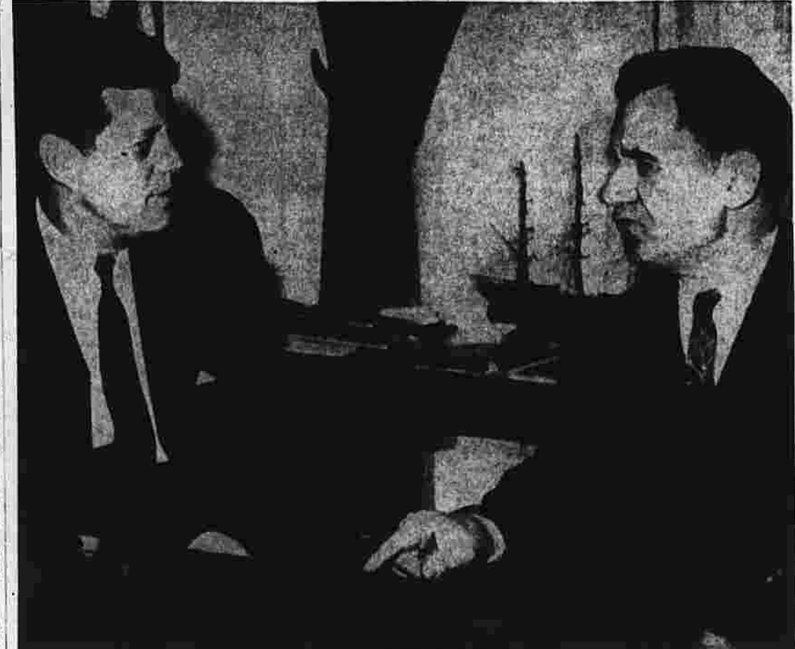
President Kennedy and Soviet Foreign Minister Andrei Gromyko meet in the President's White House office today on the crisis in Laos. They posed at the start of their meeting.

London, March 27 (AP)—Paul Getty, one of the world's richest and most prudent men, said today he has installed a pay telephone in his stately English mansion.