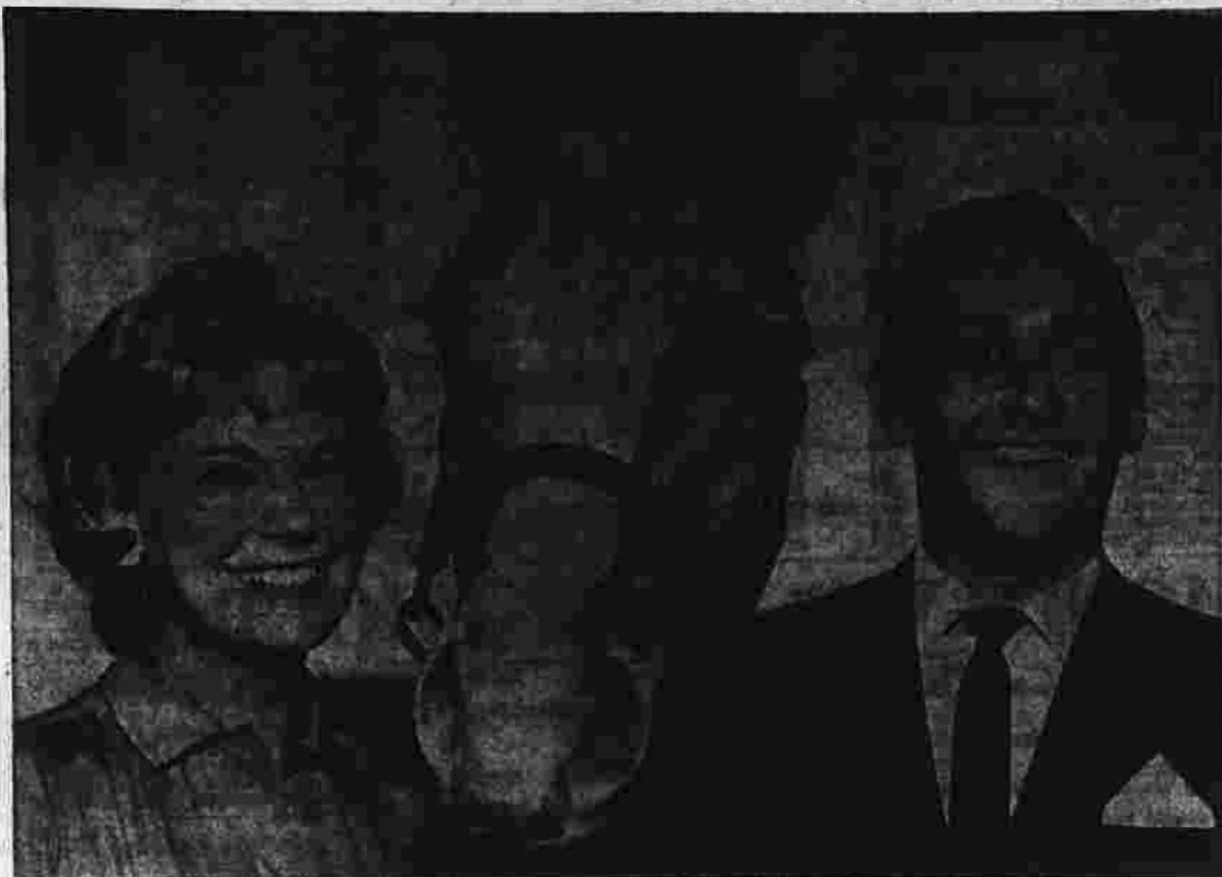
Connie Hines, Mister Ed, and Alan Young

has inherited a talking horse from the previous owner. Of course, "Mister Ed," the talking horse, will only talk to Alan, which makes for some tall situation comedy. When asked about situation comedy, Alan said, "People get clichés and get stuck with them. For the last few years, there have been all kinds of arguments about situation comedy. But it's all nonsense. All comedy is based on situations. Of course, when you can establish a set of circumstances where you develop new situations—that's where your comedy gets a fresh slant. That is why I was so thrilled with the idea of playing with "Mister Ed," the talking horse. It opened a whole new situation field. For example, the phone rings and no one is in, and the horse answers. He listens, then replies: "As soon as I finish eating my hay, I'll give him the message." It gets